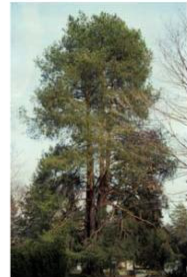
Pine Pinus species

If this tree is cared for and grows to 20 inches, it will provide $131 in annual benefits.